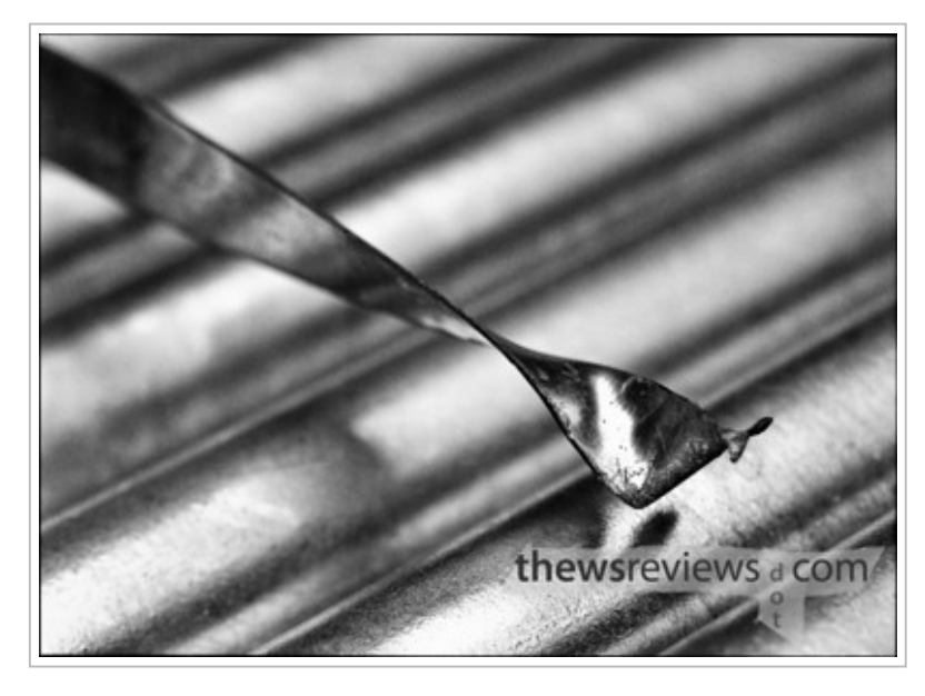
'Steel in XP2' (see bigger)

exposures on a roll of 120 film requires deliberation and planning. I'd like to say that using the Fuji takes longer to describe than to do, but it really doesn't. A 'quick' setup for one of my photos with the GX680 takes at least five minutes. Set the tripod, establish the rough composition and focus, level the camera, fine-tune the composition, relevel the camera; refine the focus, adjust the perspective controls, swing the plane of focus into place, and refine the composition, camera position, and focus once more; lock the focus knob in place. Dig out the trusty hand-held light meter, because the 680 doesn't have one built in, take a couple of exposure readings and set the shutter speed and aperture. Fold down the viewfinder, turn the camera on, and lock up the mirror; take three deep breaths and gently press the shutter switch. Flip the mirror down, turn off the camera, centre and lock the lens movements, unlock the focus knob, zero the focus, and lock the knob again before moving on. Using the camera is physically and mentally exhausting.